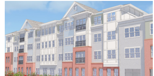
Gerard's Riverview Bordentown, NJ

6 units of affordable housing for seniors age 55 and over with a preference for veterans