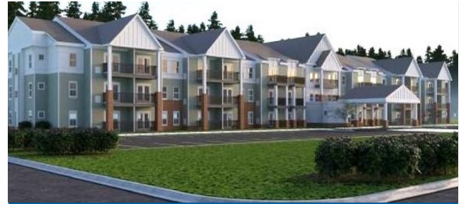
Hartford Village Medford, NJ

As the need for affordable housing grows, we rise to meet it. Our mission states that we provide needed services so our clients can lead self-fulfilled, independent lives . Our affordable housing units provide families, seniors, veterans and criminal justice involved individuals independence, but also the support of readily available case management and other crucial social services.