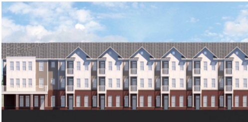
Nicholas Angelo DiLella Senior Residence Gibbstown, NJ