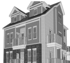
James S Brown Place Brigantine, NJ

55 units of affordable housing for seniors age 62 and over