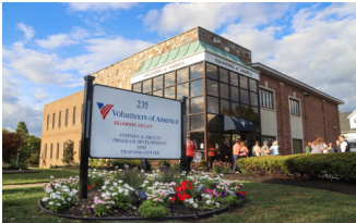
Stephen A. Shultz Program Development and Training Center Building Dedication